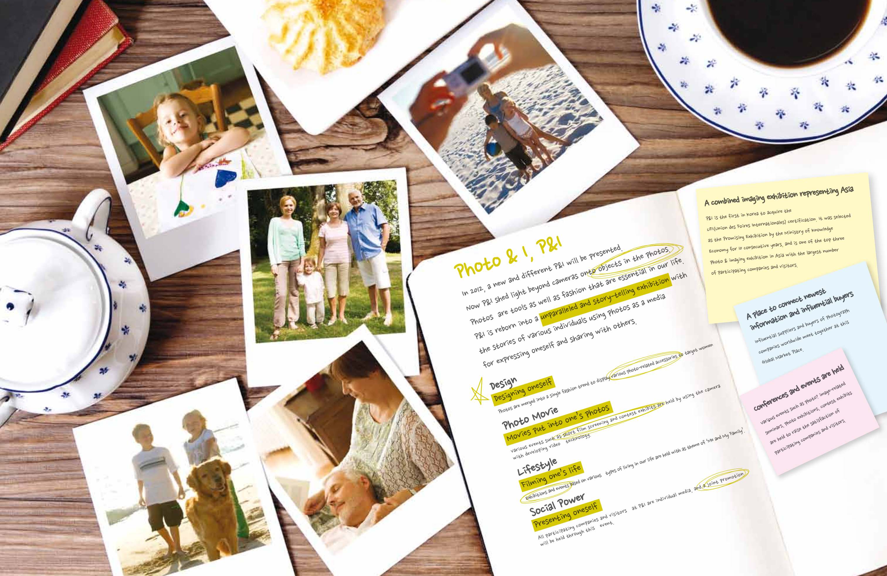
Photo & I, P&I

In 2012, a new and different P&I will be presented. Now P&I shed light beyond cameras onto objects in the photos. Photos are tools as well as fashion that are essential in our life. P&I is reborn into a unparalleled and story-telling exhibition with the stories of various individuals using photos as a media for expressing oneself and sharing with others.